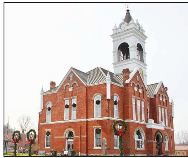
The Historic Union County Courthouse at Christmas