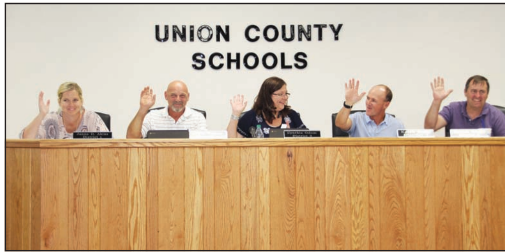
Members of the Union County Board of Education in the meeting officially establishing the Union County Schools Police Department on July 17, 2018.

While both are 1-cent countywide sales taxes that have been around for years now, the ESPLOST is collected for use